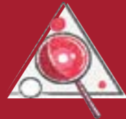
Countering Op- position Centre