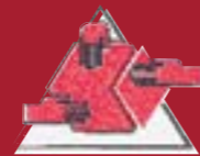
Social Move- ments Centre