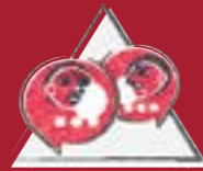
Winning Narrative Cen- tre