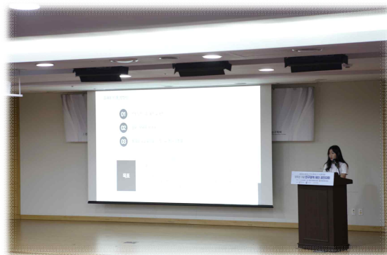
△ Presentation and Q&A sessions

Intriguing and realistic policy ideas were suggested during the competition: expanding residential and child-care support benefits for women who intend to have a second child within 30 months after their first childbirth; introducing 'Pregnant Women All-Care Service System' to effectively utilize existing policies; providing clear incentive through a family-friendly certification system;